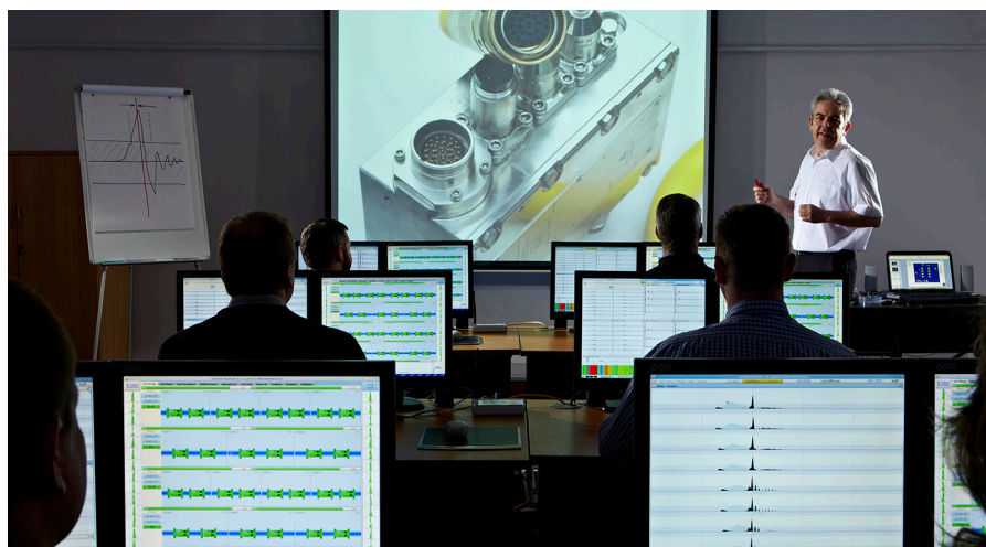
The Maltings - Seamap's Training Facility in Shepton Mallet, Somerset, U.K.