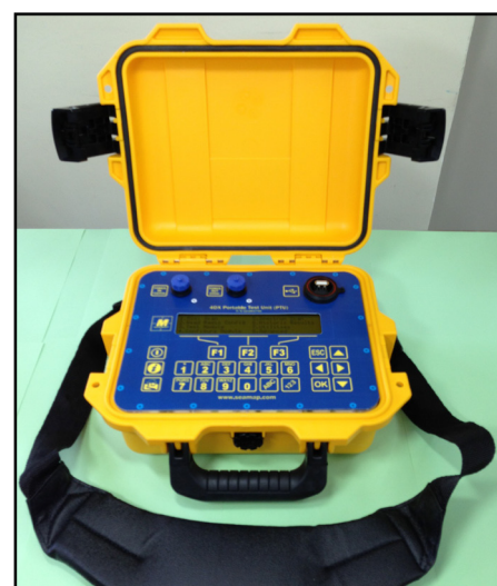
The Portable Test Unit (PTU)

The BuoyLink 4DX Portable Test Unit (PTU) provides the operator with a quick and simple means to fully test all functionality of a single module, or multiple modules consecutively, with the press of a single button. The display will report PASS or FAIL, with the option to diagnose the exact fault. All results and logs are stored internally and can be uploaded to a PC via USB. In addition, the PTU can be used to configure any aspect of the module, as well as provide advanced options for shock logging, dock side calibration and many more features.