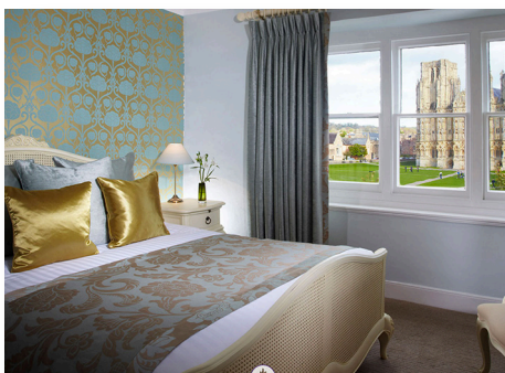
1 of 48 Individually Designed Rooms