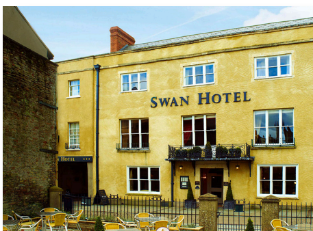
The Swan Hotel, Wells

Not included. Payment direct to providers. Check with your company before arrival.