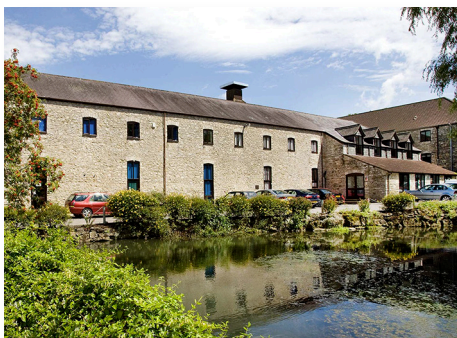
Seamap U.K., Somerset