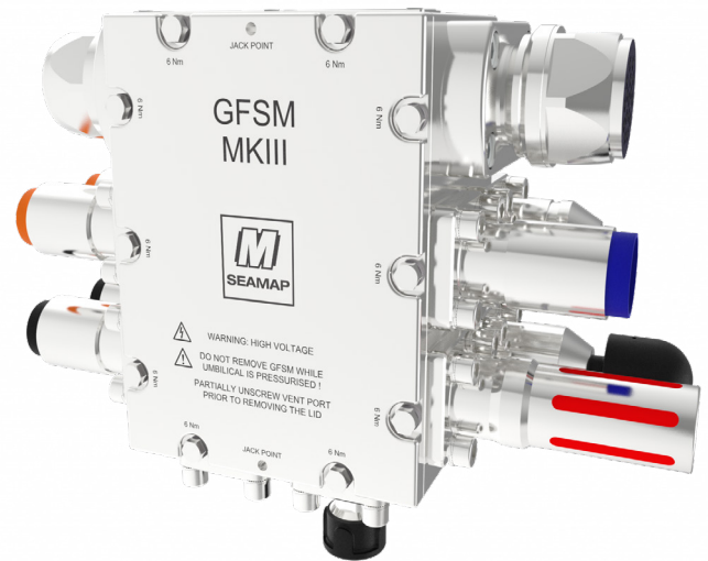
Gun Firing & Sensing Module (GFSM)