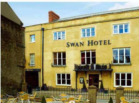
The Swan Hotel, Wells

Seamap, Shepton Mallet, Somerset, BA4 5QE, UK