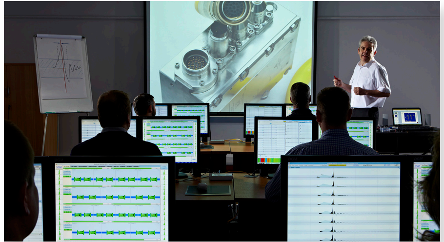
The Maltings - Seamap's Training Facility in Shepton Mallet, Somerset, U.K.