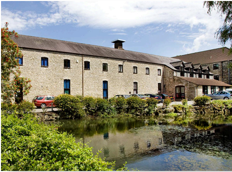
Seamap U.K., Somerset