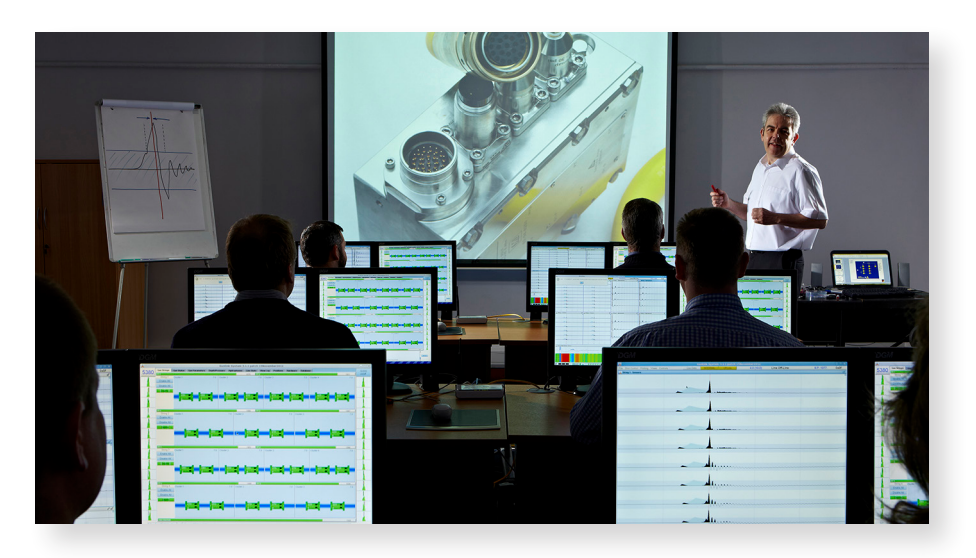
Course Venue Village Hotel Changi in Singapore. Duration: 2 days.

The GunLink interface offers extensive knowledge to the operator to help monitor gun performance and predict failures, with this tool maintenance can be carried out to prevent the guns failing online. The GunLink course agenda significantly reduces the potential of vessel downtime.