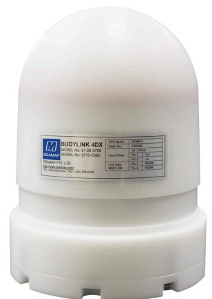
Seamap BuoyLink 4DX