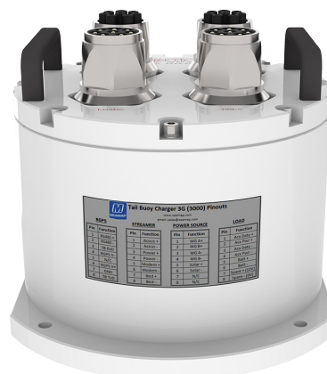
Seamap Tailbuoy Charger 3G