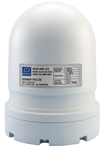
Head Buoy / Tail Buoy

The BuoyLink LITE is built for site surveys, wind farm and offshore energy infrastructure surveys, CCUS monitoring, and UHR geophysical acquisition. The Source Module positions airguns, sparkers, boomers, and other acoustic sources across scientific, engineering, and commercial operations.